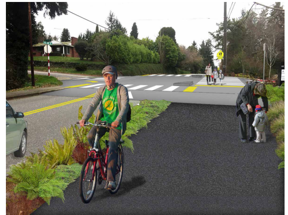
Visual simulation of shared use path and raised intersection at 100th Ave NE and NE 18th St, looking north with church driveway on the right.

前往 Chinook Middle School | 学校大厅 2001 98th Ave NE, Bellevue, WA 98004