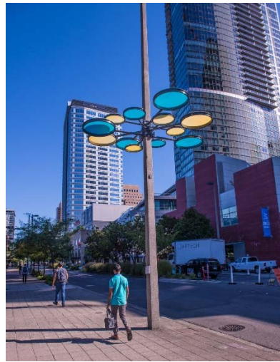
Delight in Green by Danielle Foushee, Dimensions: 10' in diameter by 3' in height