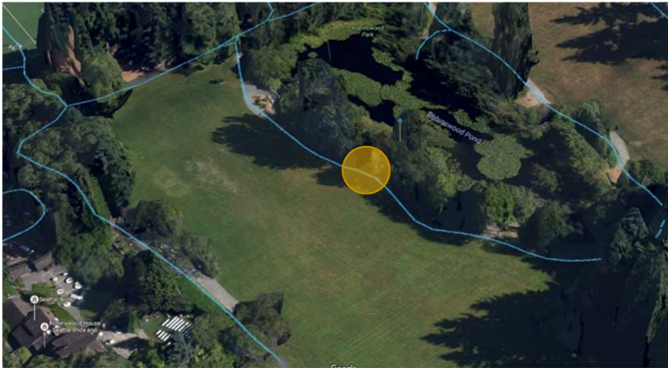
The proposed location is marked by a yellow circle and between Robinswood House and the Robinswood Pond and along the path that circles the pond.