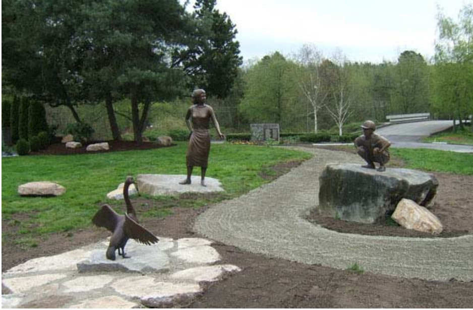
Wild in the City at the original location at the entrance to Bellefield Office Park 112 th Avenue SE and SE 15 th Street.