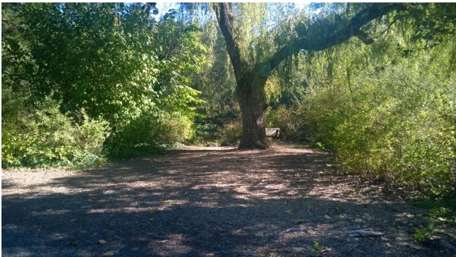
Close up of the proposed site.