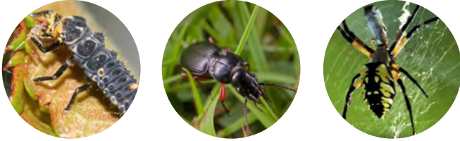
Some “good bugs,” (left to right): ladybug larvae eating aphids, ground beetle, and garden spider.

If you see damaged plants or suspected pests, look carefully to identify the problem and its cause. Most insects are not pests. A scary-looking bug may actually be eating your problem pest. Correctly identifying problems is the key to finding effective, least toxic solutions. Many pest and disease problems are caused by improper watering, fertilization, or other practices. Pesticides only make them worse by disrupting the beneficials in your garden. Check out the Resources on the back page for help identifying pests and “good guys.”