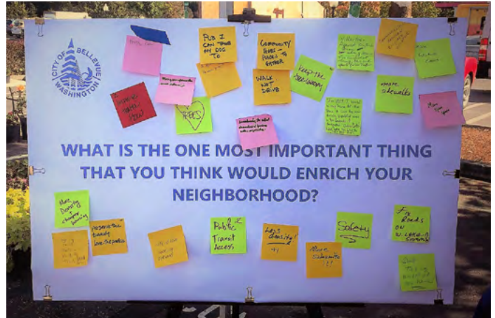
Northeast Bellevue – Sep. 18, 2018 Tabling at Crossroads Farmers Market.