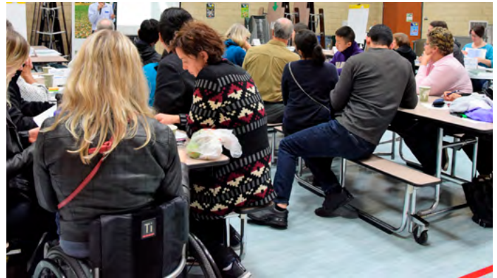
Northeast Bellevue – Oct. 10, 2018 Listening Session at Sherwood Forest Elementary School.