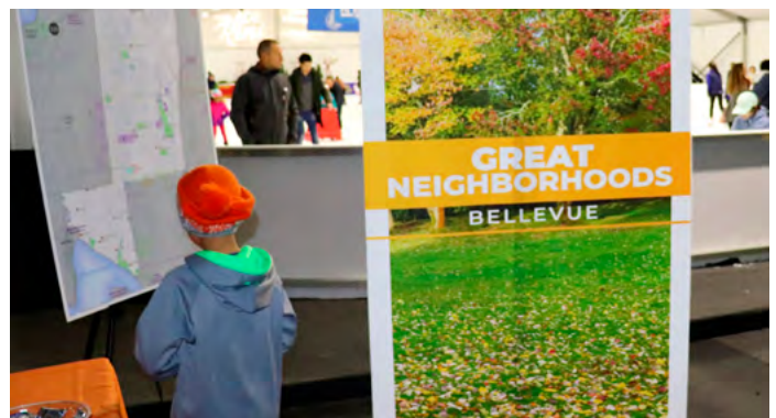
Northwest Bellevue – Jan. 7, 2019 Tabling at the Downtown Park Ice Rink.